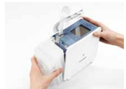
Easy change of canister

Negative pressure is regulated close to the patient's chest, with the double lumen tubing enabling detection of tubing-associated complications such as siphons, clogs, kinks, etc.