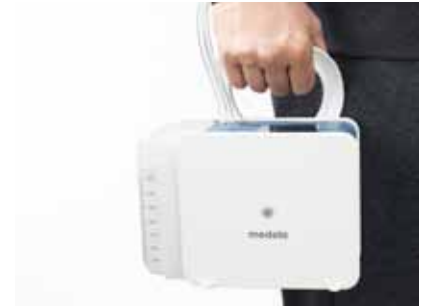
Handy and lightweight system

Early ambulation can play an important role in promoting a quicker healing process and reducing the length of hospital stay.