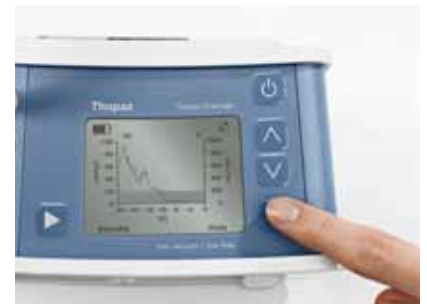
Objective data about the therapy

The continuously recorded treatment data allows the physician to manage air leaks in an objective manner, providing a significant advantage when making safe decisions for chest tube removal. This feature may lead to a reduced number of chest x-rays and an early discharge of the patient.