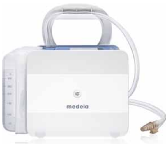
Thoracic Drainage System